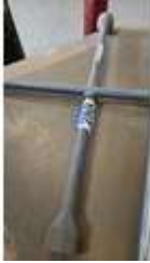
288. Wheel brace