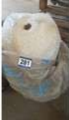
281. Roll of bubble wrap