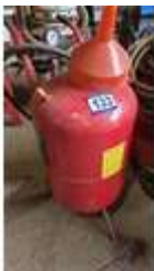
133. Sealey 75ltr shot blaster