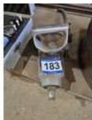
183. CP97 air wrench