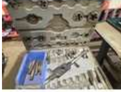
190. Taps and dies