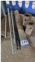
317. Qty of threaded bars etc