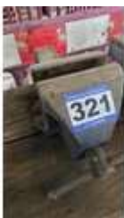
321. Record No 6 bench vice