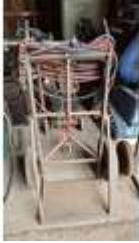
129. Gas tank trolley with acetylene pipe