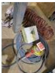
202. Pneumatic paint gun and orbital sander