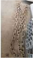
369. Tow chain