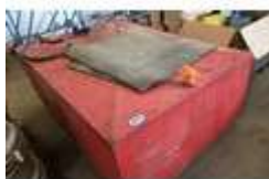
273. Steel fuel tank with hose