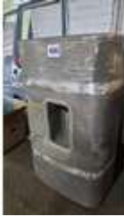
406. Volvo fuel tank