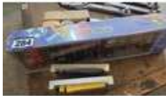
284. Model vehicles and ephemera incl. Emek 125 scale Volvo timber truck, boxed lorries and mugs