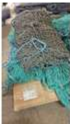
365A. Qty of lorry netting