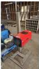
138. Tecnotest headlight tester