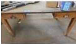
289. Vintage oak office desk