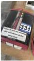
331. Sterling Pro Power Q inverter unit