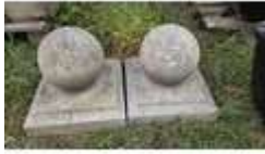
454. Pair of simulated stone spherical gate post finials