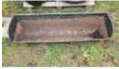
455. Vintage cast iron pig trough