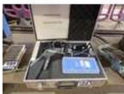
184. Screen care repair kit cased