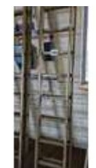
439. Galvanised extending ladder