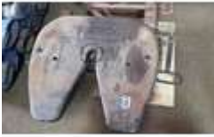
363. Fifth wheel carriage plus a plate