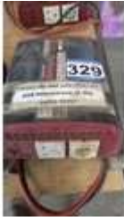
329. Sterling Pro Power Q inverter unit