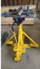
136. Hydraulic Major 1 metric tonne lift