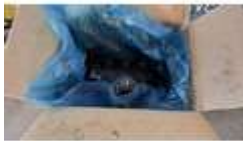
407. Volvo steering box