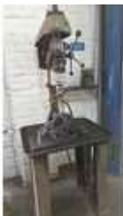
334. Walker Turner heavy duty pillar drill on stand