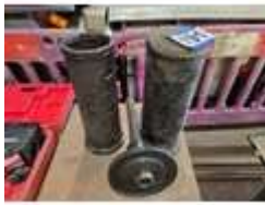
191. Large heavy duty socket/box spanner and 2 seal fitting tools