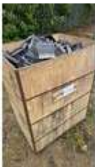
444. Crate of corner ratchet protectors