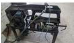
293. Power hacksaw with roller stand