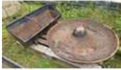
456. Two vintage cast iron pig troughs