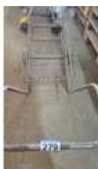
279. Wire mesh low level trolley