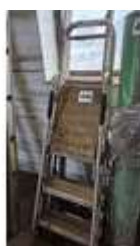
438. Galvanised steps and small ladder