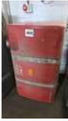
405. Volvo fuel tank