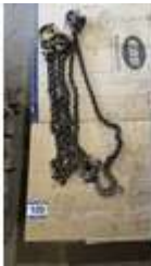
109. Qty of lifting chains