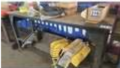
319. Steel rectangular workshop bench with lower wooden shelf approx. 180cm x 58cm