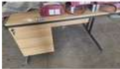
332. Modern office desk