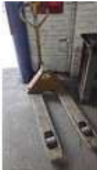
333. 2000kg pallet truck