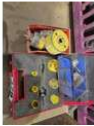
178. Electricians holesaw kit