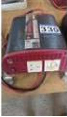
330. Sterling Pro Power Q inverter unit