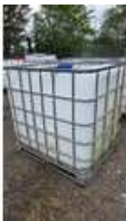
459. IBC in protective frame