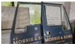
409. Pair of Volvo FL-10 doors