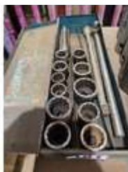
181. Kamasa part socket set