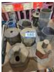
180. Heavy duty sockets