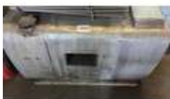
404. Volvo fuel tank