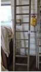
441. Wooden ladder