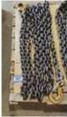
107. Long chain