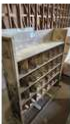
113. Vintage workshop steel pigeonhole rack