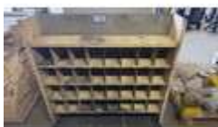
112. Vintage workshop steel pigeonhole rack