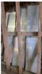
111. Qty of galvanised sheeting panels and internal fire door