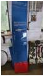
400. Volvo air kit blade