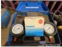
196. HGV airline tester