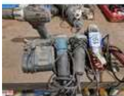
194. Three single grinders, soldering iron and cordless drill