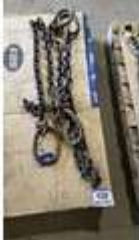
108. Two chains