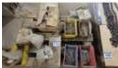
110. Qty of galvanised staples, roofing bolts etc