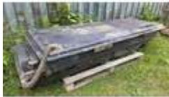
457. Two fuel top tanks