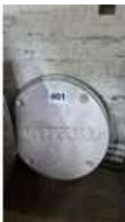
401. Two exhaust guards