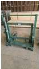
137. Compac wheel changing lift