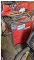
132. Cebora plasma prof F70 welder (as found)