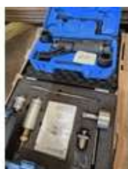
211. Torque wrench multiplier and seal repairer