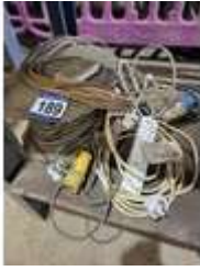
189. Electric cabling