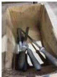
199. Qty of files