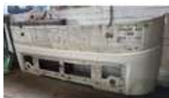
433. Volvo FH 4 grill