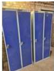
210. Two pairs of steel workshop lockers