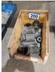
200. Qty of sockets