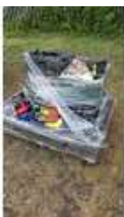
445. Qty of corner ratchet protectors