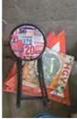
370. Triangular warning signs etc