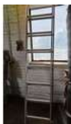
436. Galvanised ladder