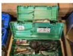
212. Two boxed Leister vinyl heat repair guns