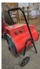
277. Sealey IBX4 15Kw 3-phase electric fan heater