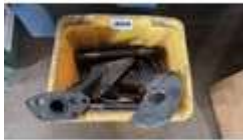
408. Volvo brake parts