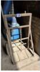
128. Gas tank trolley