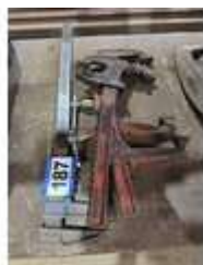
187. Three carver clamps plus another