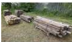
446. Five stacks of timber