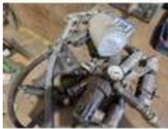
198. Qty of air tools