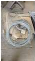
335. Qty of galvanised wire