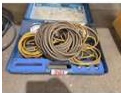
201. Bendix cased airline testing kit