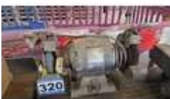
320. Black & Decker bench grinder