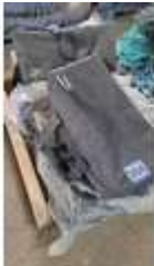
366. Qty of Aeroflex storage bags