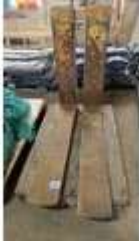
364. Two heavy duty forklift tines