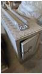
282. Lorry locker aluminium box