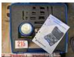
215. Sykes Pickavant diesel engine compression kit