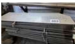
403. Volvo ADR mounting kit