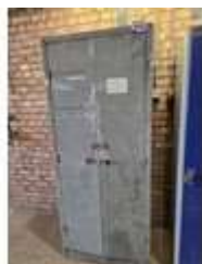
210A. Steel workshop cabinet