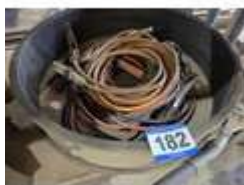
182. Jump leads and tyre inflating bands