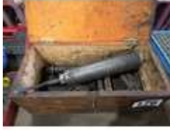
176. Wooden box incl. pins etc