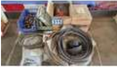
315. Various spares incl. fan belts, rollers etc