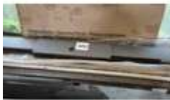
402. Volvo F10/12 door window panel, bumper panel etc