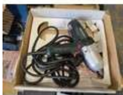
214. Metabo single phase socket wrench