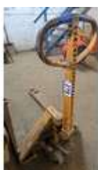
278. Vestergaard 2500kg pallet truck