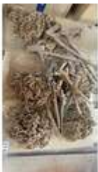
374. Five chain and ratchet sets