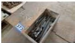
373. ERF toolbox and spanners