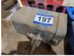
197. Small vintage fuel tank and sediment bowl