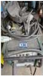
130. Migatron 325 welder