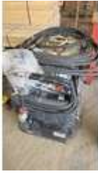
135. Mac International Avant kerosene pressure washer