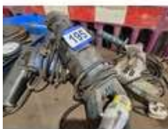
195. Four electric drills, one a 110v