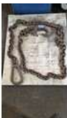
368. Tow chain