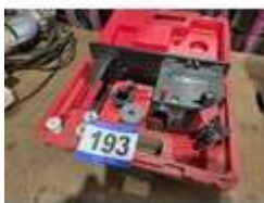
193. Market drill bit sharpener