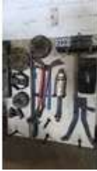
399. Tool shadow board