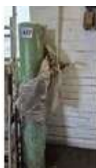
437. Roll of plastic sheeting