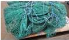
365. Qty of lorry netting