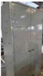
290. Workshop steel cabinet with shelved interior