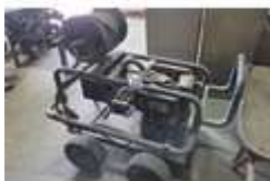
292. V-Tuff torrent 5 diesel power washer