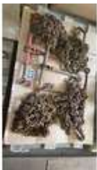
375. Four chain and ratchet sets