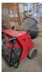
276. Sealey 45.5KW multifuel workshop heater, model IR55. V2 with safety cage