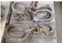
367. Lifting hook and chain