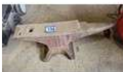
134. Large vintage anvil