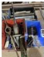
188. Taps, dies etc