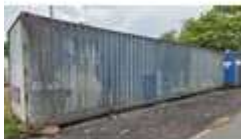
443. 40' metal container