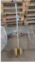
280. Easyline line marker