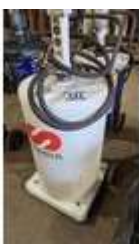
141. Samoa oil dispenser