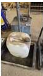
140. Kew B9 pressure washer