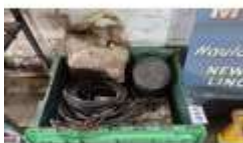
411. Automatic lubrication kit