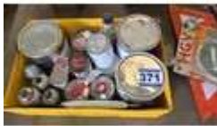
371. Box of misc. paint