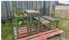
458. Steel steps