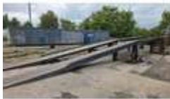
442. Truck/lorry wash ramp