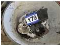
179. Sykes Pickavant torque gauge and jam pan