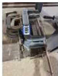
186. Nine G-clamps