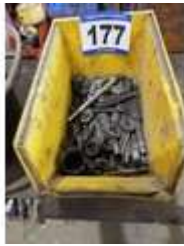
177. Taps and dies