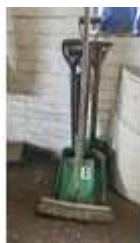
434. Five shovels and a brush