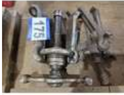
175. Two heavy duty hub pullers