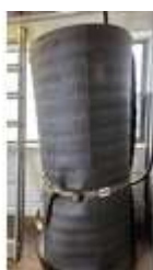
435. Roll of foam