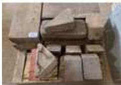
283. Pallet of wooden chocks