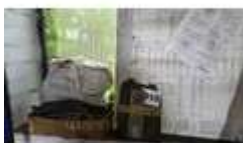
410. Volvo service date chart etc