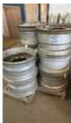
274. 10 lorry wheel rims 22.5