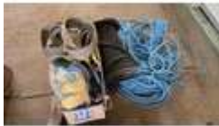
372. New bungy cord, rope, straps etc