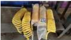
318. 5 sections of brake airlines