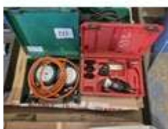
213. Air pressure gauges and small grinder