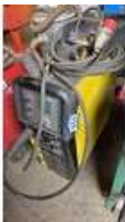
131. ESAB C340 Pro mig welder