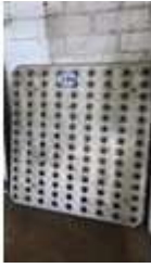
398. Two Volvo foot plates