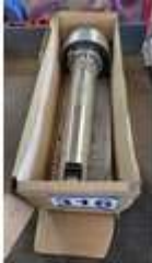
316. Boxed Tiss TankSafe, anti-syphon fitting