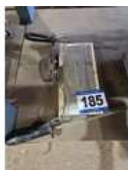
185. Nolten 12v battery tester