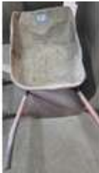
291. Haemmerlin wheelbarrow (distressed)