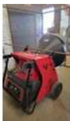
275. Sealey 45.5KW multifuel workshop heater, model IR55. V2 with safety cage