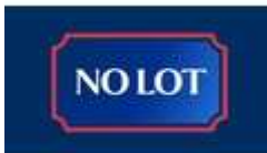
139. NO LOT